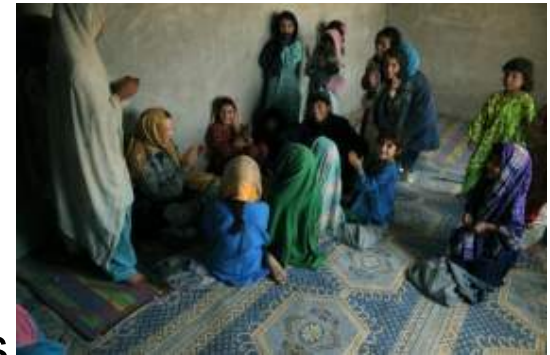
(U) Zabul PRT, July 08, 2010